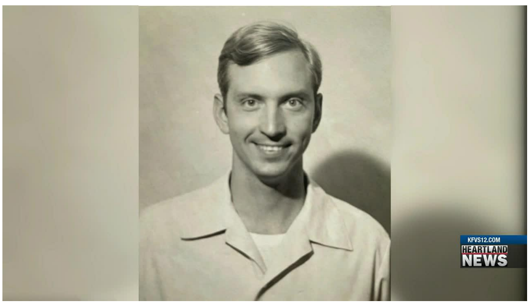
More than 40 years after a murder victim's remains are found in Cape Girardeau County, a family in Texas can finally grieve and say goodbye.